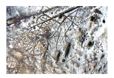
Fig. 12. Pre-historic stone on Belasica mountain (Aleksovski)