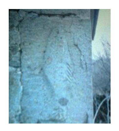
Fig. 1. A fish