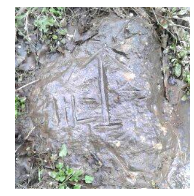
Fig. 2. Arrows and marks