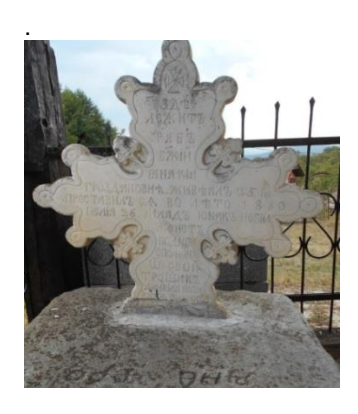
Fig. 18. A Templar knights' cross in the village of Premka, Kichevo