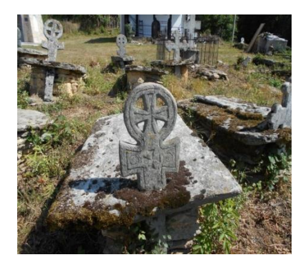
Fig. 19. A Templar knights' cross in the village of Premka, Kichevo