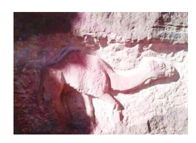
Fig. 5. An engraved camel