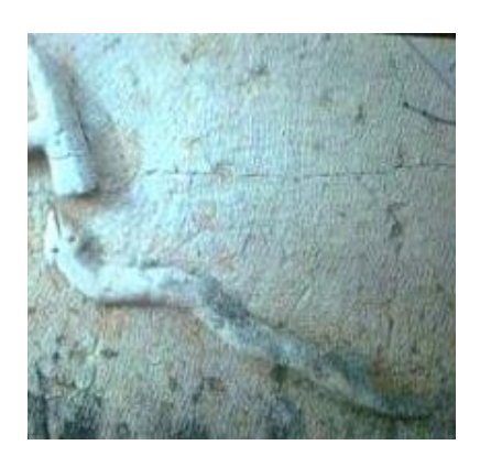
Fig. 3. A hammer and a snake