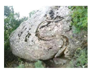
Fig. 4. An engraved snake