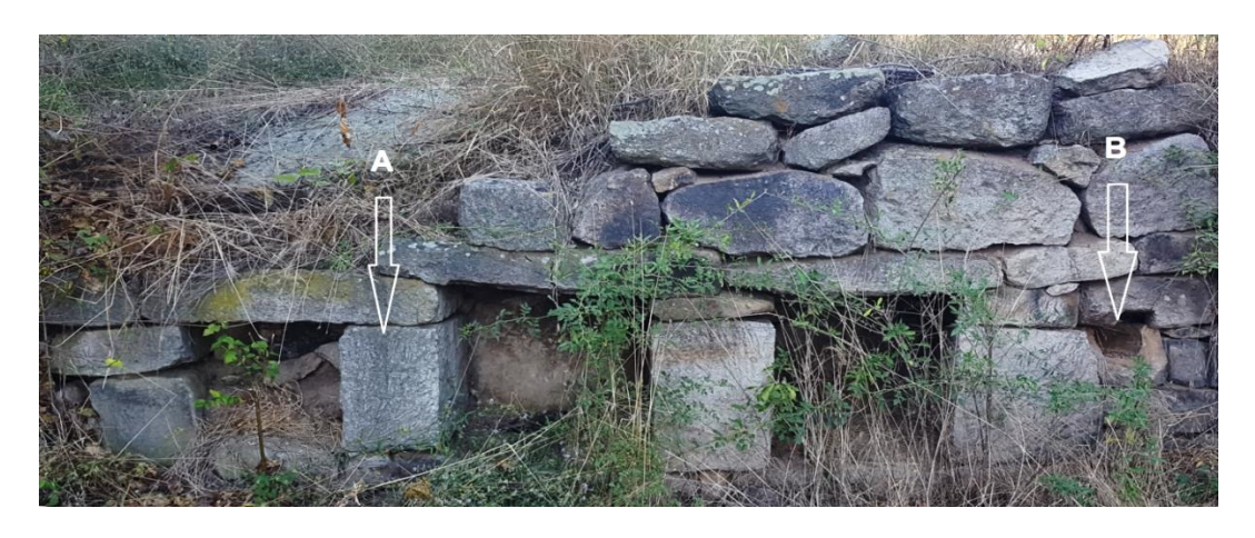
Fig. 10. Stone ovens, A, an engraved cross, of which one hand end with a circle: there used to be gold coins burried iun this direction, horisontally B, which were taken out by somebody